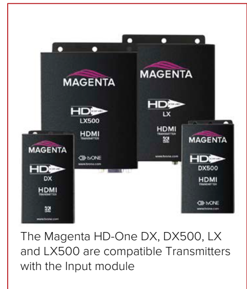
The Magenta HD-One DX, DX500, LX and LX500 are compatible Transmitters with the Input module

The 4K HDBaseT (dual) input module for CORIOmaster, CORIOmaster mini, and the CORIOmaster micro allows for the input of uncompressed, high resolution 4K Video and Audio from stand-alone transmitters located up to 150m away. The HDBaseT input Module also allows for Ethernet to be accessible from distant transmitters. This module can be used with transmitters that support HDBaseT, HDBaseT-Lite and HDBaseT-Extended mode.