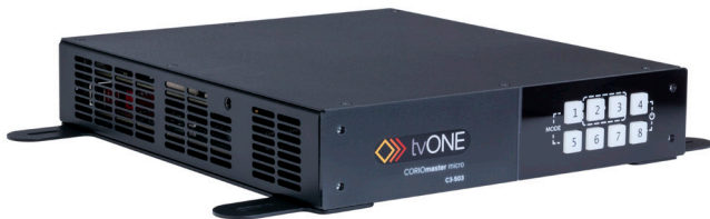
RM-503-SRF C3-503 Surface Mount; brackets allow for under table or behind monitor mounting