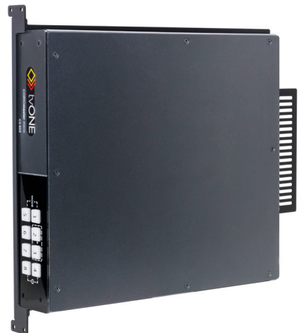
RM-503-1RK-MOD C3-503 ONErack Mounting Module, fits in 6RU ONErack chassis.