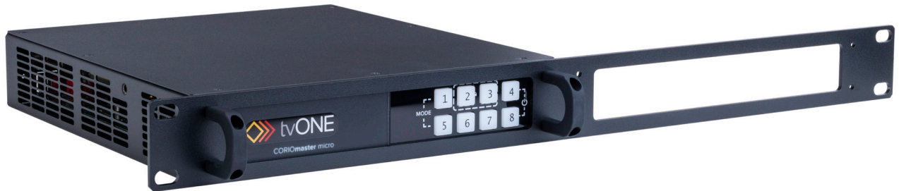
RM-503-1RU-DUAL C3-503 Dual Rack Mounting Faceplate, in 1RU