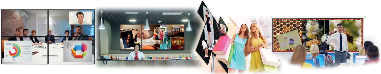
2x2 Video Wall